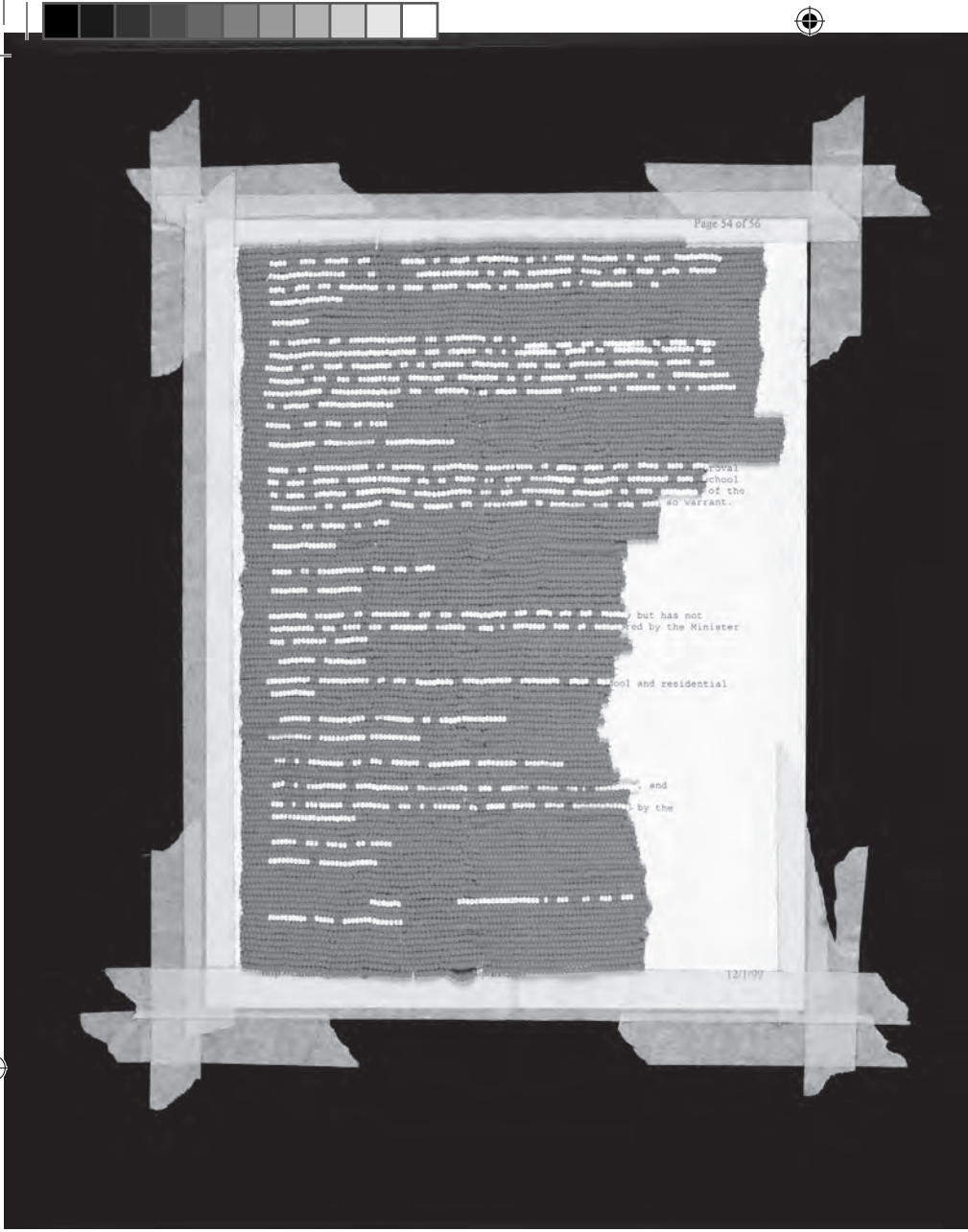
Bernard Leach (British [Hong Kong], 1887–1979) Covered Pot , no date stoneware, glaze 10.7 x 13.0 x 13.0 cm